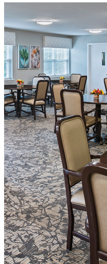
Photos shown from our portfolio of American House images, individual communities differ.

Our beautiful, tree-filled community offers peaceful spaces to visit with friends, as well as engaging daily activities and events.